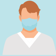
Dentist/Dental Therapist/ Dental Hygienist