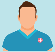
Nurse Practitioner/ Prescriber